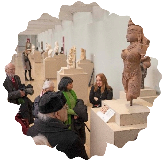
NKS Service Users at NMS