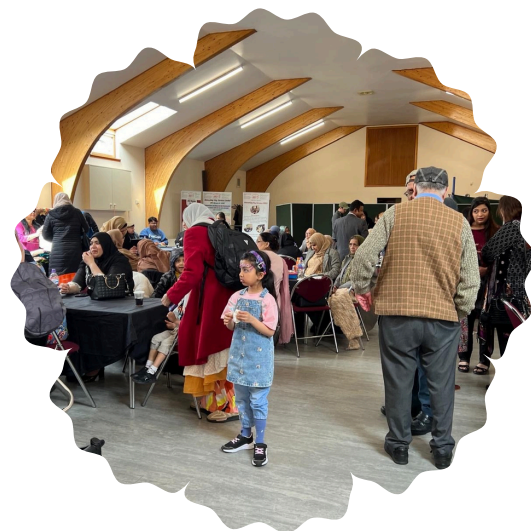
NKS Open Day ~ June 2023

NKS has also effectively engaged communities through various group activities. Last year, the organisation facilitated eight different groups under its umbrella attended by over 100 individuals. These included three lunch clubs for older South Asian people, which attracted a significant number of participants. In addition to a women's group and a men's group, NKS successfully ran a mixed group for older adults, attended by both men and women. To address the isolation and exclusion faced by Bangladeshi women in South Asian communities, a dedicated group was established specifically for them. Two Bangladeshi community workers have been actively encouraging these women to participate in the organised activities.