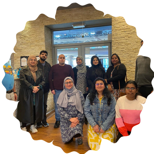
NKS Autism Session ~ July 2024