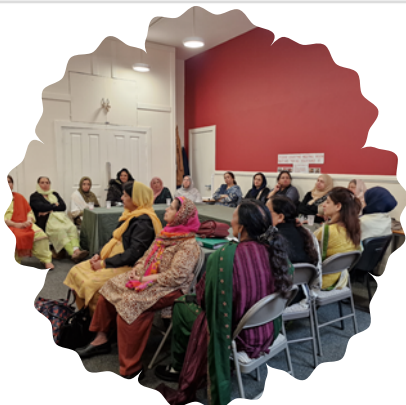
Benefit Talk with NKS Service Users

The NKS Family Support Service is here to help you with lots of different issues such as: welfare benefits; schooling; housing; information; advocacy and advice. NKS can help you.