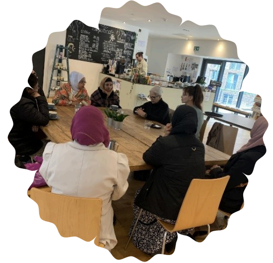
NKS Storytelling Session