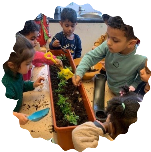
NKS Nursery Children Gardening