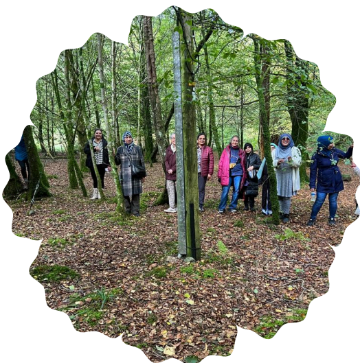
NKS Residential ~ September 2023